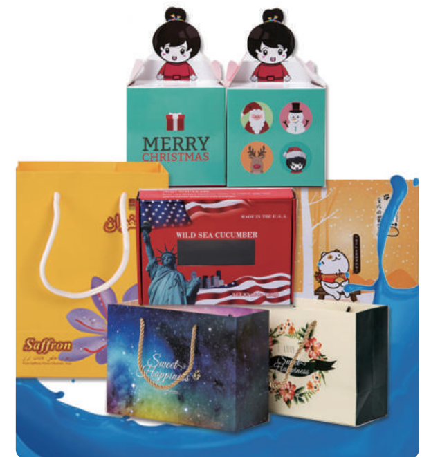
Han FullColor® Food-Safe Aqueous Ink