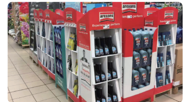
Retail ready display